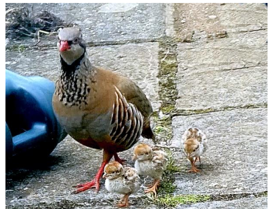
THE ATTENTIVE MOTHER AND THREE OF HER CHICKS

On the 17 th June the number of birds in our garden was given an unexpected boost. Looking out onto our patio, I was suddenly aware of about 10 little balls of fluff running around --- recently hatched red legged partridge chicks. Their mother was gently calling them trying to lead them into cover. A very attentive mother, she had obviously hatched her brood in a nest hidden somewhere in the wild section of our garden (which is most of it!) A couple of days later, she stood her ground in a great show of bravado, as I had to free one of the chicks that had become entangled in the netting of the vegetable cage. Coming close she scolded me for interfering with one of her offspring, and showed little fear of me as I gently released the wayward chick. The last I saw of them was a couple of days later, when I was pleased to see that she still had 9 chicks with her.