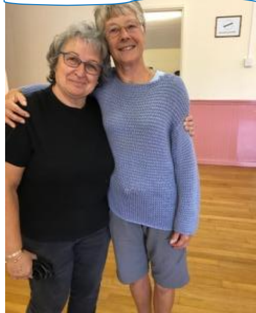
Winners of the Horticulture Event

Once more we have been invited to St. Andrew's School for our Christmas lunch on 17th December. We are very fortunate to celebrate Christmas with the staff and pupils and we thank them for again inviting us.