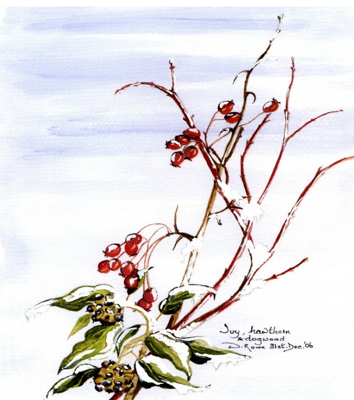
The Season's Greetings to One and All

I mentioned a couple of field names above, these were all come from "Bulmer Then and Now" published in 1979 and now available on the Bulmer web site.