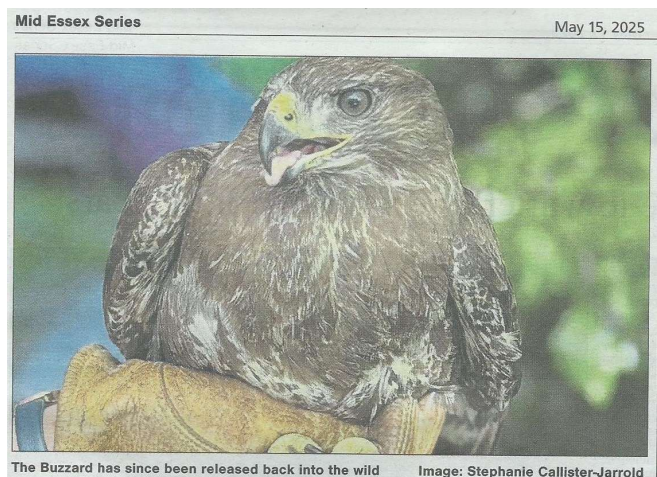
The Buzzard has since been released back into the wild

A BIRD rescue is "thrilled" In release a buzzard back into the wild after it was shot near Halstead. Owls and Birds of Prey Rescue Suffolk and Essex is run by Stephanie Callister-Jarrold, The charity rescues injured and orphaned owls and birds of prey before releasing them back into the wild.