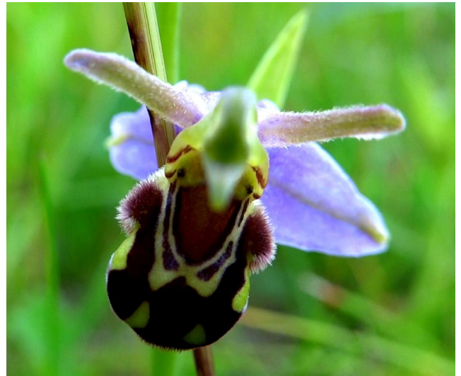
Close up of a bee orchid

our window, I have only rarely seen one in the village before and to me this was a tragedy. In early September, Irene Dickinson called with another sad little window casualty. We identified this as a young willow warbler. These incredibly beautiful and delicate little birds often appear in gardens at this time of the year, when they are moving around preparing to migrate. It's amazing to think that such tiny birds, weighing not a lot more than a 20p piece, fly thousands of miles to spend the winter in the south of Africa before returning to us in the Spring. There was marked absence of blackbirds in our garden during August, & September. Our rowan tree was still sporting a good show of red berries, whereas in most years the blackbirds strip them as soon as they start to change colour. One that we did must have spent 10 minutes or more feeding on the lawn, on what looked to be nothing but grass. Closer inspection showed that it was actually picking up ants.