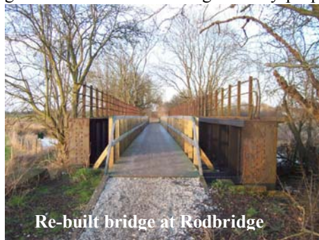
Re-built bridge at Rodbridge

January's walk started from Rodbridge picnic site on a very warm and sunny afternoon. I would say a very unusually warm January afternoon but with our now fairly erratic weather patterns I think it's becoming less unusual and such episodes of good weather have to just be enjoyed whenever they arrive, so enjoy we did on our circuit of Borley and Brundon. Our afternoons circuit gave us the chance to take in the sights of Borley church (where a huge number of snowdrops were in flower) from paths along the field edges before joining the road into the beautiful village of Borley itself. Our next path, which was situated down beside the garden of one of the villages lovely properties then led us