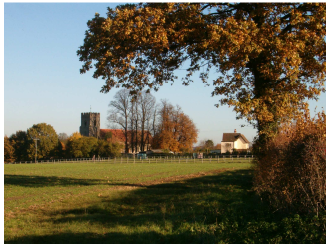
St. Andrew's Church