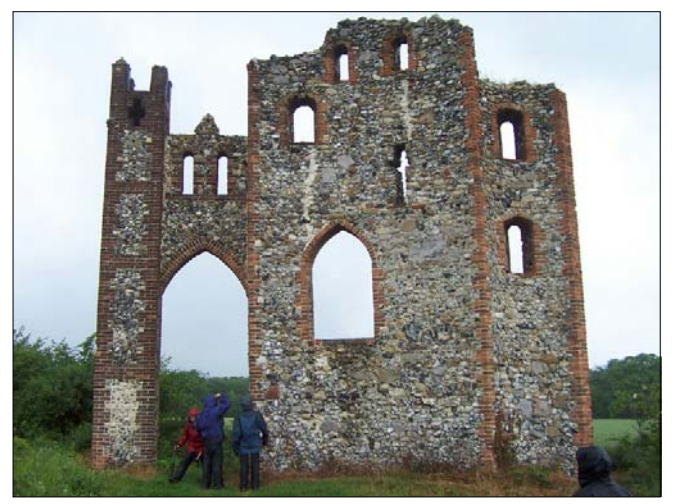
take us down to the folly. As the rains still came we only spent a short time studying the folly but you could see where the elements were gradually taking its toll on this marvellous solidly built structure. On first sighting it looks as though it is the remaining ruins of something much grander due to its ornate and sturdy construction but I am informed that this is

And so to the final walk of Spring. On the Sunday of the last Bank Holiday of May Belchamp was our destination once more heading off for the fields behind Belchamp Hall where our paths enabled us to take a close up look at the folly. Even the continuous rain that was showing no sign of abating didn't deter five waterproof clad souls from setting off from the village hall to dodge dog doo in the fields behind Bulmer Street and wade their way up to Belchamp Church via the back tracks of Goldingham Hall. Passing the church we took the road veering left and very soon found the path that would