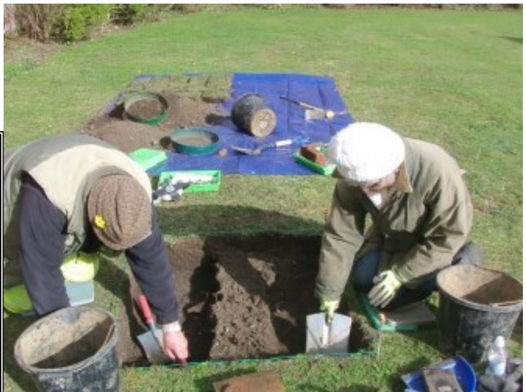
(Continued on page 2)

Turn to the back page for a list of your village volunteers