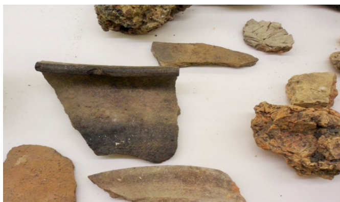
Figure 1- Early eleventh century pottery found at Goldingham Hall (SVCA)