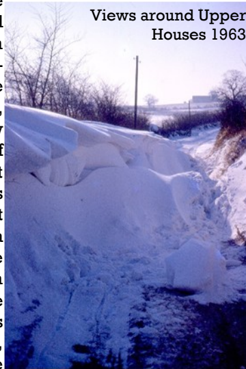
Views around Upper Houses 1963

snow was the intense cold. The school milk rations froze up every day, and our 1/3 pt. milk bottles were thawed out