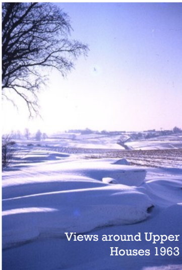
Views around Upper Houses 1963

Years ago a young lad worked for us. We were working close to a small stream in Gestingthorpe, I suddenly spotted a kingfisher perched in the hedge ---- "Look Darren a kingfisher!" ---- "What, that little bird ?, it's been there all morning", came the disinterested reply. Well nearly everyone loves to see a kingfisher!