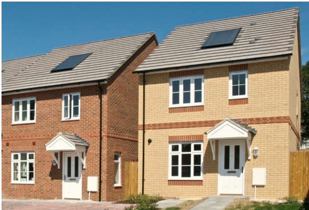
(An example of Affordable Houses)

Delivered with this newsletter is a survey to establish if there is a need. The survey is being carried out by the Rural Community Council of Essex (RCCE) on behalf of the Parish Council. It has NOTHING to do with the recent Braintree District Councils Local Plan for 2017 to 2033. If there is a need, land can be allocated outside the Local Plan.