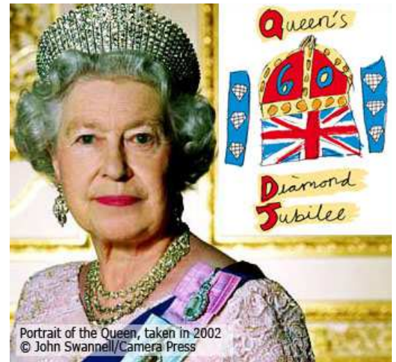
Portrait of the Queen, taken in 2002

There will be a family service in St Andrew's Church.