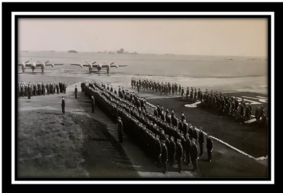
VE Day Parade at RAF Bradwell Bay

VE Day celebrations were held throughout the day. A Thanksgiving Service was attended by the whole station, at which the Station Commander gave a short address describing the meaning of VE Day. The rest of the day was regarded as a holiday and in the evening an all ranks dance was held which was attended by most of the Station. Free drinks and refreshments were provided by P.S.I. and Mess Funds.