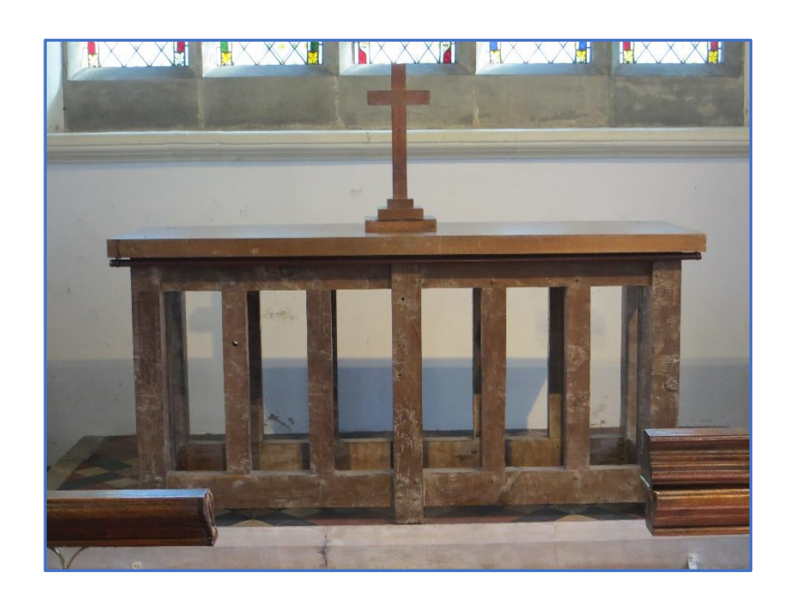
Psalm 22 - Why Have You Forsaken Me?

https://www.youtube.com/watch?v=36Y_ztEW1NE