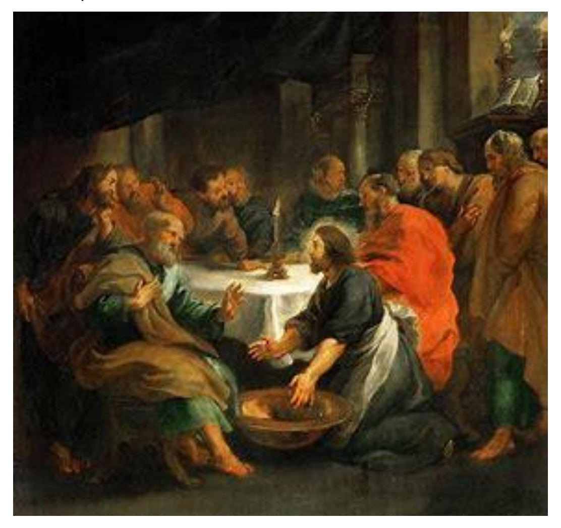
Christ Washing The Apostles' Feet is a painting by Peter Paul Rubens

brought first to his disciples and then his followers after his death and resurrection, so that we can also continue to proclaim his death until he comes again and show that we are his disciples, Amen .