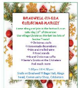
The Christmas Market is in aid of Bradwell Village Hall and Church. Celebrating 90 years since the opening of the Village Hall in 1922.