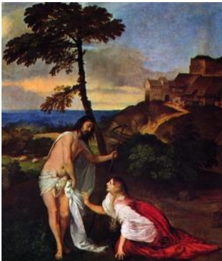
Titian – Noli me Tangere