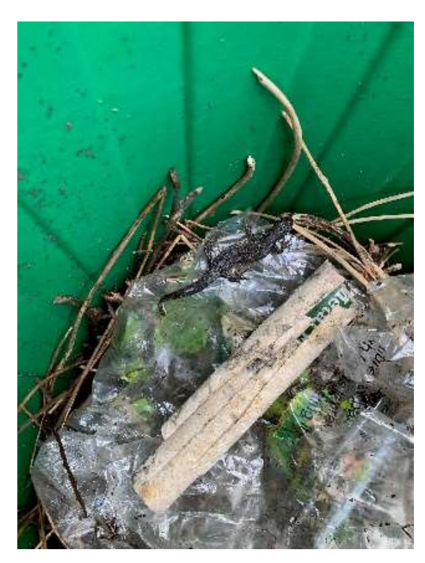
Above (both): Great Crested Newt in "composting bin" in neighbouring garden to R26