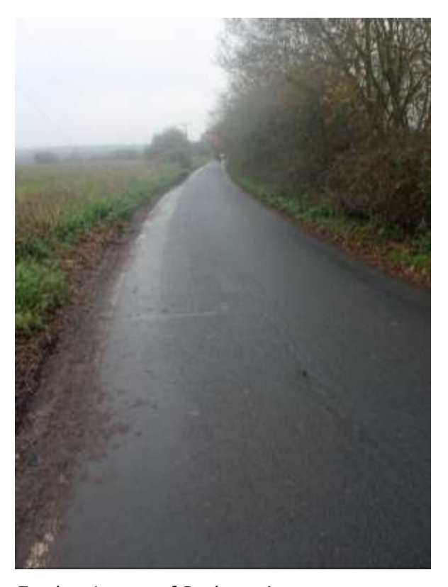
Further image of Redrose Lane - note cut-up verges and lack of centre lines (i.e. delineating insufficient width for two vehicles to pass)