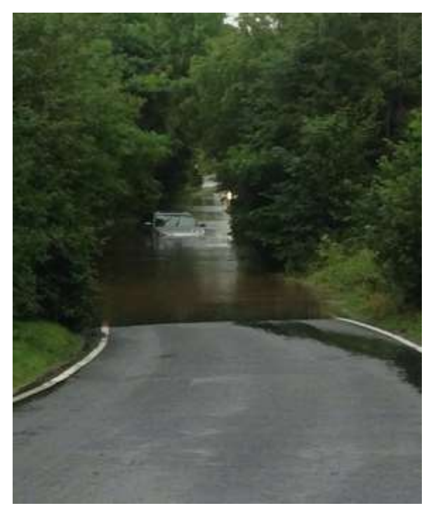
Above: Flooding on Redrose Lane - 2016 (note depth of water)