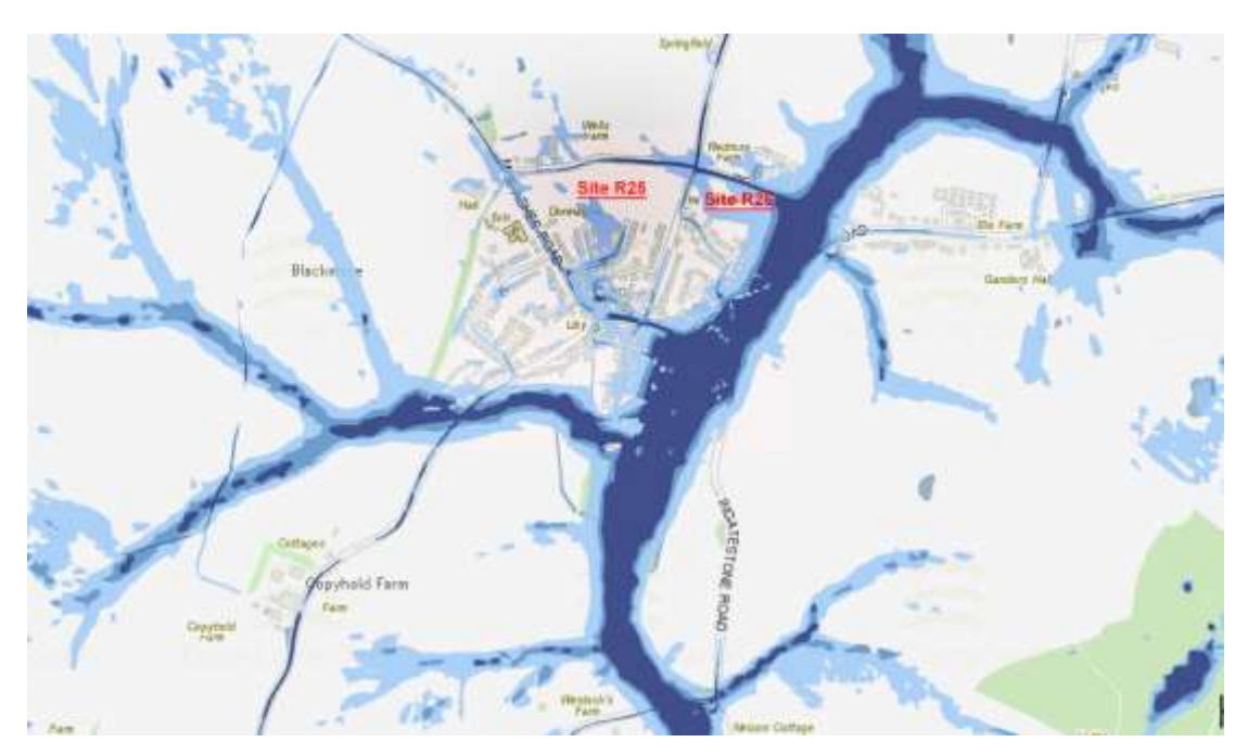
Flood risk map 2018 (source – Essex County Council website – "check if you are at risk of flooding" – with annotations)