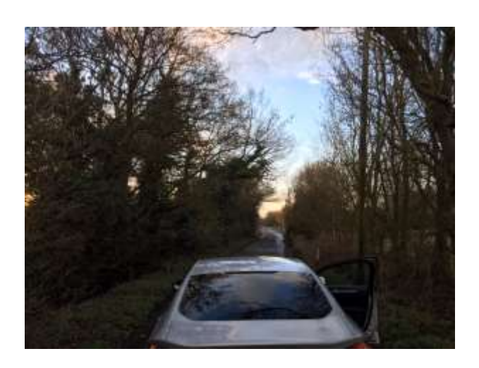
Above: image illustrating width (or lack of) of Redrose Lane