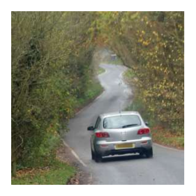
Redrose Lane from Chelmsford Road junction