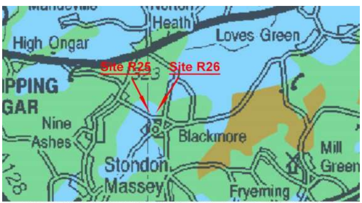
The Sites' Agricultural Land Classification (ALC008 - Eastern Region): Very Good (blue).