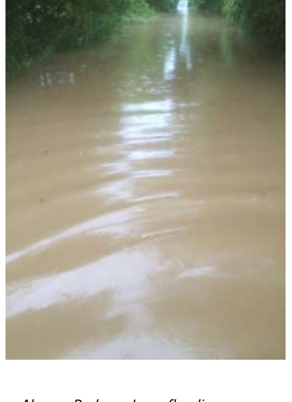
Above: Redrose Lane flooding - 23 June 2016