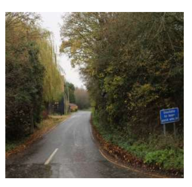
Redrose Lane from Nine Ashes Road junction