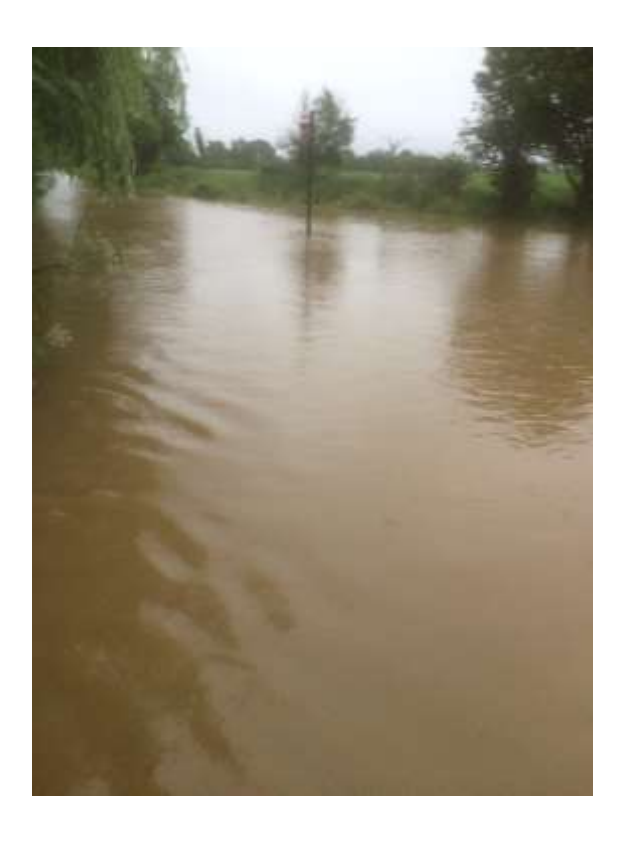
Above: Chelmsford Road flooding - 23 June 2016 (n.b. next to site R26)