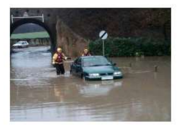
A woman being rescued from her car in Burnt House Lane, Ingatestone.

PUBLISHED: 11:35 18 January 2011 | UPDATED: 09:59 19 January 2011 | IAN WEINFASS