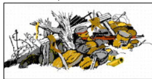
iPad sketch of how the sniper will look camouflaged in his firing position based on British period photographs of the German parapets

I imagined the tough wee man from Stirling smoking a fag on duty but the helmet was historically inaccurate as the Brodie steel helmet was not universally introduced until autumn 1915 and unbelievably