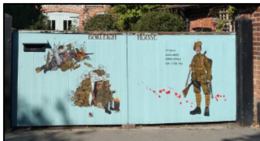
Freshly painted gates, Burleigh House, Baythorne End