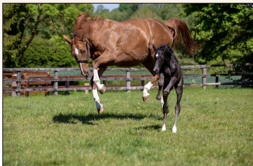
Left: Fruity, first time out