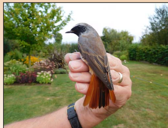
Above: Redstart Opposite: Woodpeckers

Well, what a non-event summer was. I can assure you, it has officially finished as most of the Swifts have already headed off to warmer climes and yesterday I even saw a few family parties of swallows zooming southwards. The regular flock of village Swifts disappeared at the start of the month and they could be in Southern Spain or North Africa by now. Swallows seem to have had a difficult summer with many fellow birders reporting failed broods and reduced clutch sizes. There still seem to be a few House martins around the village and hopefully they have fared a little better. Some of you will have spotted a Hobby chasing the Swifts and Swallows around the village. Like a small version of a Peregrine they supplement their diet of flying insects (especially dragonflies) with Swifts, Swallows and Martins. They are also migrants and will follow the southern bound flocks of swifts and swallows all the way down to their wintering grounds in Africa.