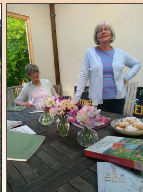
L: the First of the summer flowers.