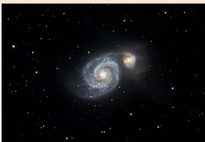
M51 Whirlpool 8Edge 16thMar21 BAA