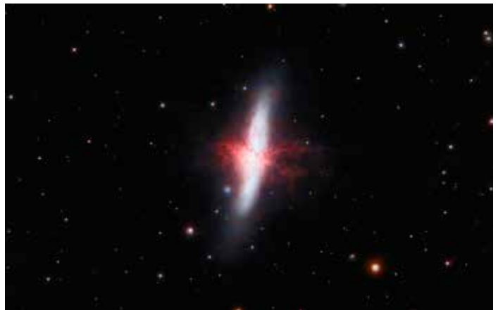
All data captured from her Birdbrook garden.

This is an amazing Starburst galaxy whose structure is believed to be “an irregular galaxy” – in Ursa Major (The plough) constellation. M82 is being physically affected by its larger neighbour – M81 Bodes galaxy. It’s approx 12M Light yrs from Earth – not far at all.