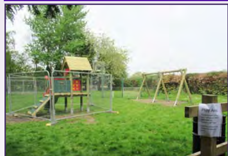
Refurbishment began 26th April 2022

Birdbrook Bring and Buy Plant Sale re-scheduled to Sat 4th June alongside Jubilee festivities