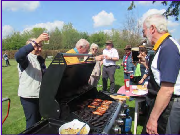
Photos left and below from the Bowls Club open day, Sunday 24th April. Well attended on a lovely, warm sunny afternoon, in a superb setting, a try at bowling, and the delicious barbeque.

Our open afternoon was held on the 24th April from 12 noon to 4 pm, combined with signing on for all members.