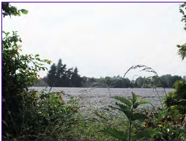
Photo of the field of phacelia, alongside the road from Ridgewell to Ashen, part of the Baythorne Park Estate, featured as the July picture in the 2022 FOHL calendar

In the main house he replaced the Victorian fireplaces, made two additional bathrooms, put in central heating and replaced the mosaic floor in the hall with mahogany flooring. Over the years he made many changes.