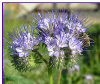
Left: The pretty blue flowers of phacelia, (borage family), are very attractive to insects, including bees. It is grown as a green manure crop in small gardens as well as large fields.