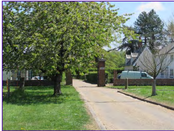
The present day entrance to Baythorne Park at Baythorne End

1954: bathrooms and flush toilets were added to the cottages on the estate 1955: concrete paths in the kitchen garden 1957: planted two spinneys, one each side of the park 1960: created the horseshoes on the cedar lawn 1961: replaced the slate roofs with old tiles in the garage, put down the concrete and built a range of four garages 1965: hard tennis court and swimming pool 1969: converted original stables to a dwelling known as Stable Court; changing room installed at the swimming pool 1990: built the lake in the front park 1996: altered the main entrance gates to Baythorne Park 2005: extended the present gardens to the Temple Lawn.