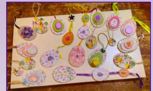
Easter crafts at the April BLG meeting

Our April meeting involved a bit of Easter crafting. The members were able to use their own creativity to decorate wooden Easter eggs using whatever they had to hand. There were some wonderful finished products and very individual, no doubt they will take pride of place over the Easter celebrations. There were not many of us but we had great fun. A short Easter quiz was completed and I think we all learnt some interesting facts. We had our usual raffle, many of the prizes had an Easter theme and refreshments included hot cross buns.