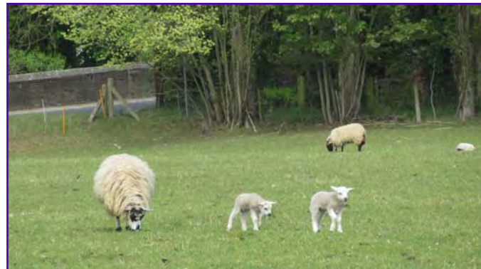
Above: lambs at Baythorne End, May 2022.