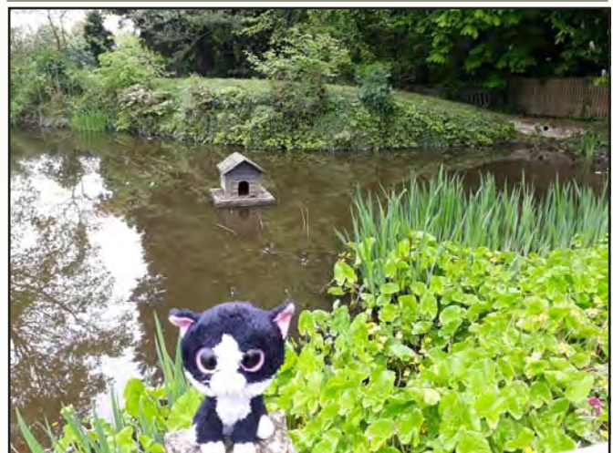
See more of Tiddles' adventures p4 & p11.