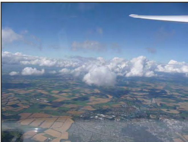
View of Bury St Edmunds from a Ridgewell glider

We visited the Ridgewell airfield, just outside Ashen, and booked a trial lesson, a half hour flight in a glider with an instructor. Visitors are enrolled as temporary members / trainees. They have the option to take the controls once in the air, or just enjoy the experience. The day arrived and I remember thinking the launch was rather serene and gentle, being towed aloft behind a powered aircraft and released at 3000 ft. My instructor demonstrated the controls and encouraged me to try for myself. It all seemed quite straightforward. I was later told that if