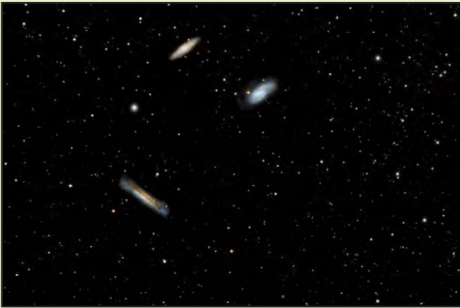
M65, M66 and NGC 3628 galaxies, known as the Leo triplet (they are in the constellation of Leo) – approx 35 Million Light years from us.