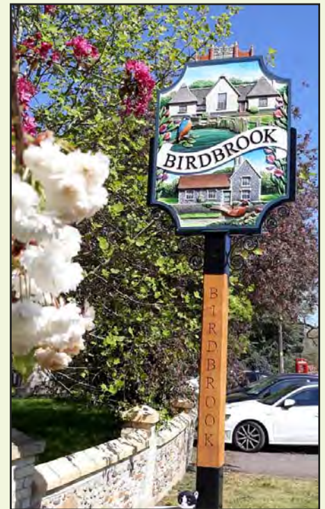
See more of Tiddles' adventures p3 & p11.