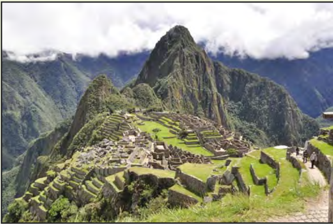
Peru: just one of the many virtual tours at www.heygo.com

If you're interested, these tours are not only free, though you're invited to make a donation if you enjoyed the visit, but the places are far less crowded than normal, due to covid era travel restrictions: www.heygo.com