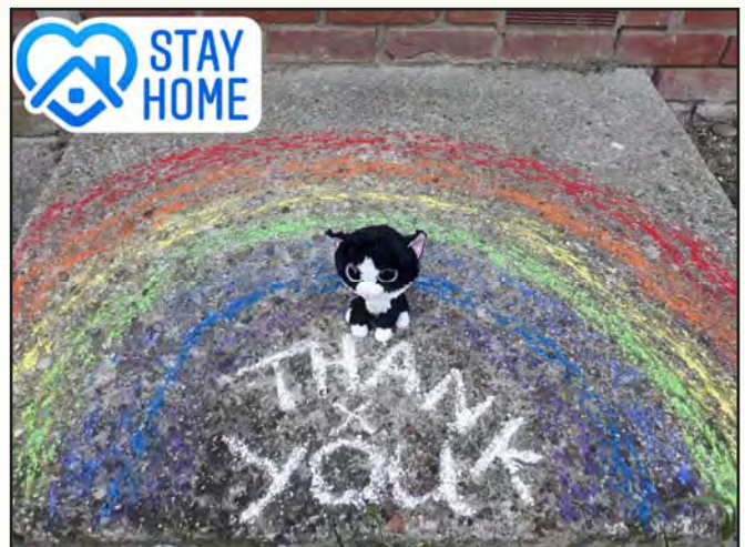
Tiddles, bringing love, smiles and happiness wherever he goes!

Many of us in the village will have followed the story of, ‘Tiddles the cat’! From children to adults, he has given us both serious and comedy tales from his daily life. We give a special thanks to Tiddles’ owners for sharing their time and experiences over this last year with us.