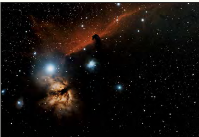
NGC 2023 (AKA Horsehead Nebula) & NGC 2024 (Flame nebula) in the Constellation of Orion - Approx 1,500 Light years from Earth i.e. 9,000 Trillion miles away – so not too far away.....