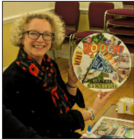
Top left: Christmas meal at The Three Horseshoes