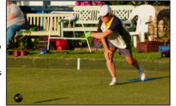
Above and below: The Bowls Club on special days