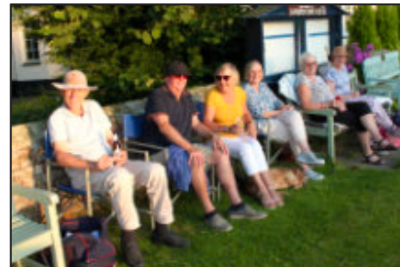
Birdbrook Bowls Club in Action

is for the weather to be kind. As always, if you fancy trying your hand at the ancient game of lawn bowls, why not come along to any of our roll-up nights during the season and give it a go. Age is no barrier, membership is open to all and you will be made very welcome. Hope to see you soon.