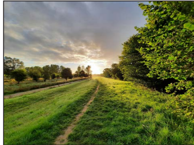
Meldham Washlands, the Floodpark, Haverhill (West Town Park)

To find out more email fofETP@gmail.com or find the group in the park on a Monday or Wednesday morning.