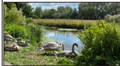
Swans in Clare Country Park, one of your superb photos selected for the 2023 FOHL calendar.