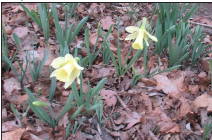
Early daffodils at Milton Country Park, Cambridge

People at greatest risk of frauds, scams and cyber-crimes are those over 75, repeat victims, people who have mental health issues or suffer poor health and victims of dating or romance fraud.