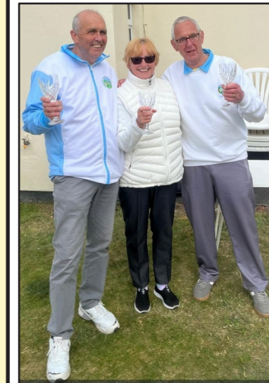
Castle Camps winning team from President's Day

Where a household fails to comply, the Council has powers to issue written warnings. Continued non-compliance can result in a Fixed Penalty Notice, which carries a right of appeal to the First-tier Tribunal. Non-statutory guidance on the use of penalties for non-compliance with household waste collection requirements emphasises that enforcement should be proportionate and targeted at cases causing genuine harm to the local environment. Penalties will not be issued for minor issues. The Council will adopt an educational approach before issuing penalties, such as providing households with written advice or information and including engagement visits. The Fixed Penalty Notice will be for £80, with a discounted rate of £60 for payment within 10 days.