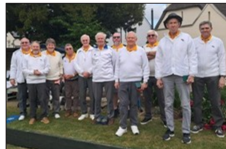
Above right: new gate Right: First home match of the season