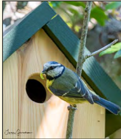
Blue tit with grub.

One thing that will of course attract birds into your gardens are nest boxes. A simple box made up from some scrap wood can provide a home for a Blue or Great tit family and provides great entertainment once the adults start feeding their ravenous young.