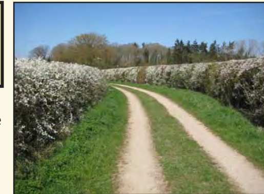
Winning photo entry featured for February in the 2022 FOHL Calendar

Following the success of the 2022 calendar, Friends of Haverhill Library are repeating the invitation to send your entries for the 2023 calendar. The A3 wall calendar features at least 25 photos. You can see a copy of the 2022