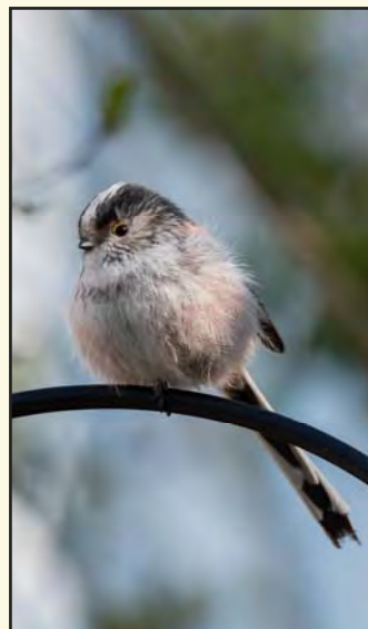
Long tailed tit.