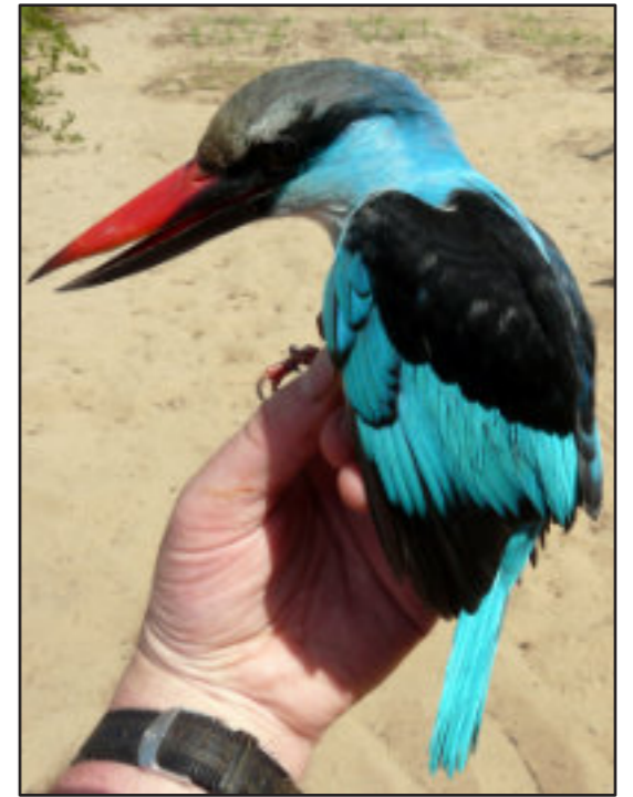
Uganda 1997-8: Blue-breasted kingfisher