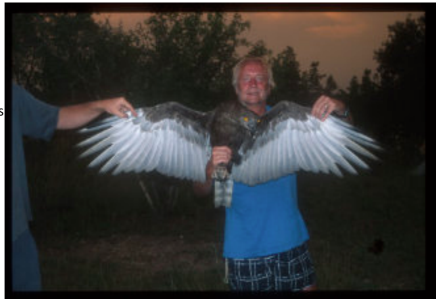
Uganda 1997-8: This big bird of prey is a Brown snake-eagle.