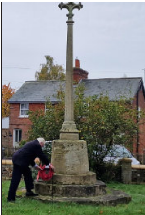
Remembrance Day wreath laying at the Birdbrook Memorial.