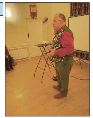
in Sturmer with our usual Secret Santa.

Our next meeting is our Christmas meal at the Red Lion