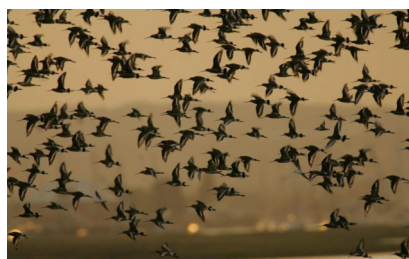
Black-tailed godwits by Darren Chaplin

Around the edges of the nature reserve work has been going on to create new ditches for water voles, restore ponds for