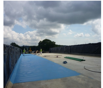
Spray applied waterproofing to London Road Bridge deck

The London Road will need to be temporarily closed for a weekend in September to allow contractors to tie-in the new bridge to the existing road and exact dates and times will be notified to residents.