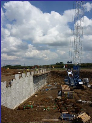
Sadlers Hall Bridge reinforced earth abutment