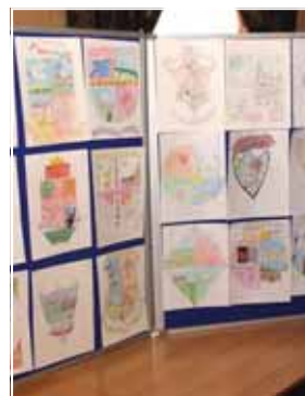
Some competition entries