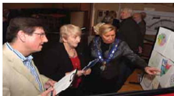
Judging the entries