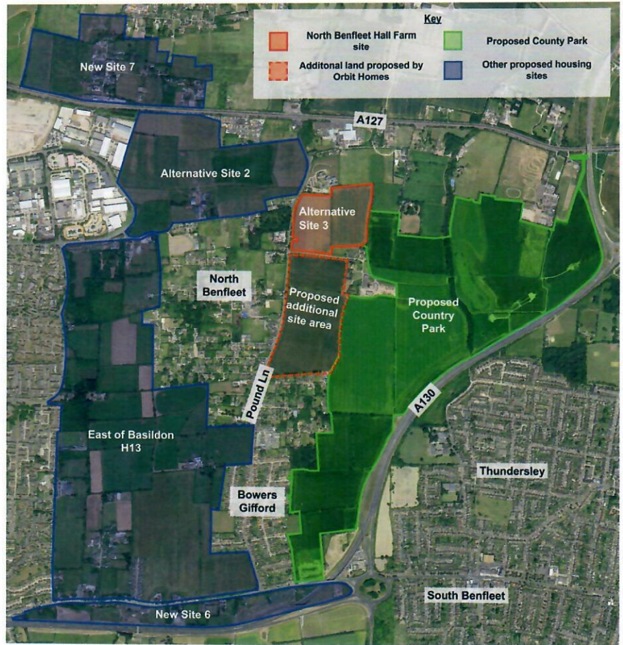
Map showing Land at North Benfleet Hall Farm and other adjacent sites

The North Benfleet Hall Farm site also sits within the designated Bowers Gifford & North Benfleet Neighbourhood Area and proposals for a Neighbourhood Plan, covering Bowers Gifford and North Benfleet, will shape the way development comes forward in the local area.