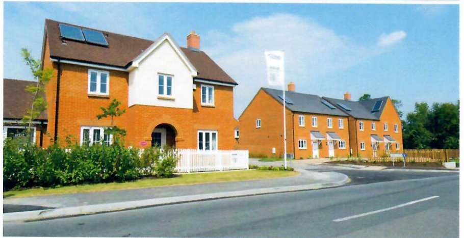
Images showing existing Orbit Homes developments