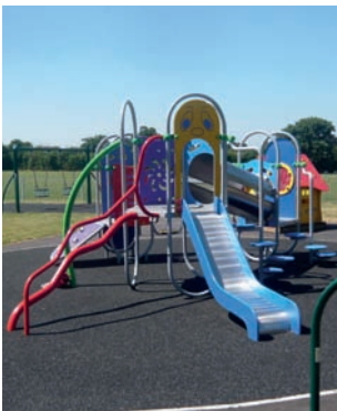
In 2012 the Parish Council successfully applied for funding of a junior play area in Westlake Park. What next?..... See page 3

The Parish Council will keep residents informed of developments via Parish Council meetings, their website www.essexinfo.net/bgn-parishcouncil or the Parish Council noticeboards.