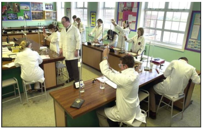
Year 12 (L6) 2003 Chemistry

Recently posted on the Gazette website some images of the 1990's and 2000's at school.