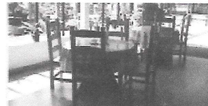
Restaurant and Coffee Shop