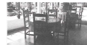
Restaurant and Coffee Shop

CHILDRENS SOFT PLAY CENTRE Jumping Pillow Muddy Kitchen Pygmy Goats Witches Wood Rabbits Cafe Birthday Parties