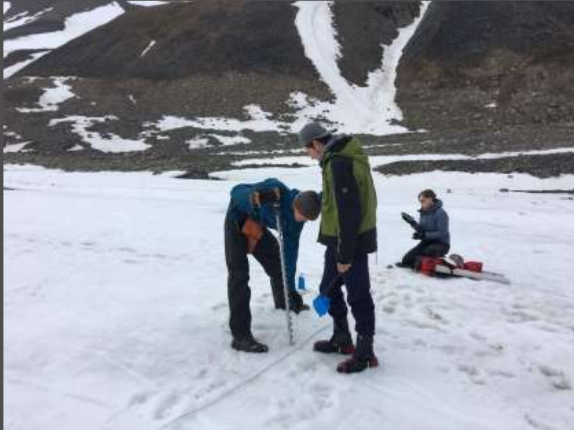
INVESTIGATING THE CONTROLS OF SUMMER MELT AND ITS RELATIONSHIP WITH PROGLACIAL STREAM DISCHARGE