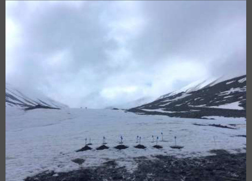
RESEARCHING THE IMPACT OF DEBRIS ON GLACIAL MELT, AND ASSESSING TERMINUS RETREAT SINCE 2010