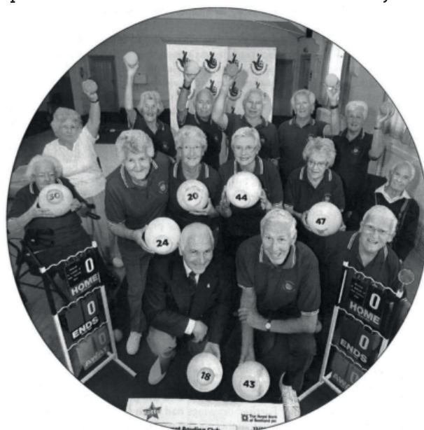
Members of the Alresford Bowls Club lottery syndicate seen here with the winning numbers

September 2009: Alresford Bowls Club Lottery Win