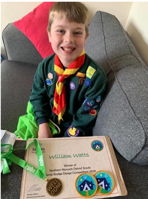
District Camp at Home, Badge Design

A little insight to what some of the groups have been getting up to over the past 18 months.