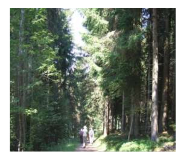
We came to a wind turbine