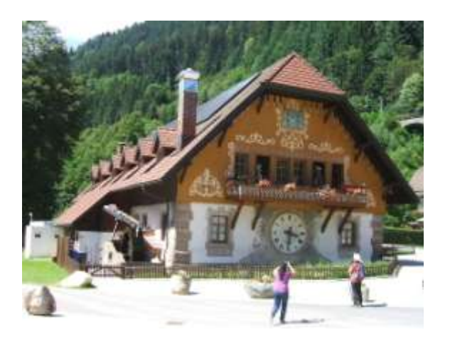
We walked back to Hinterzarten through the Löffeltal ('spoon valley', where spoons were once made).

On the next day (Wednesday), we went by bus and tram to Schauinsland, where we went up the cable car to one of the highest viewpoints in the Black Forest (1264 m).