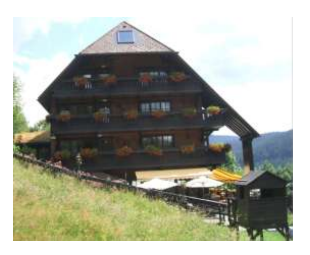
We had lunch at a small restaurant at the end of the lake and then walked round the lake

where we stopped for morning coffee at a restaurant beside the lake.