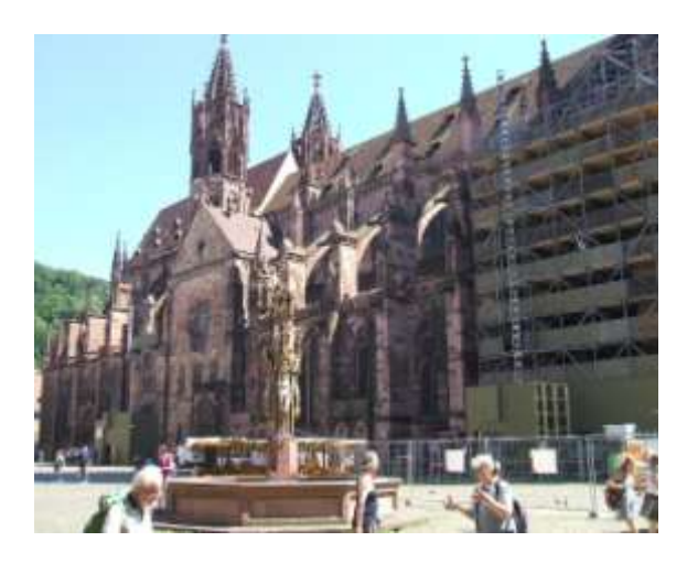
and the cathedral close.