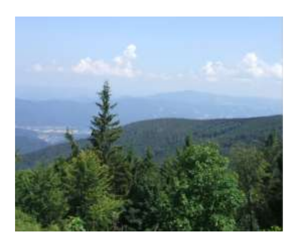
The more energetic members climbed up the tower at the top.

On the next day (Wednesday), we went by bus and tram to Schauinsland, where we went up the cable car to one of the highest viewpoints in the Black Forest (1264 m).