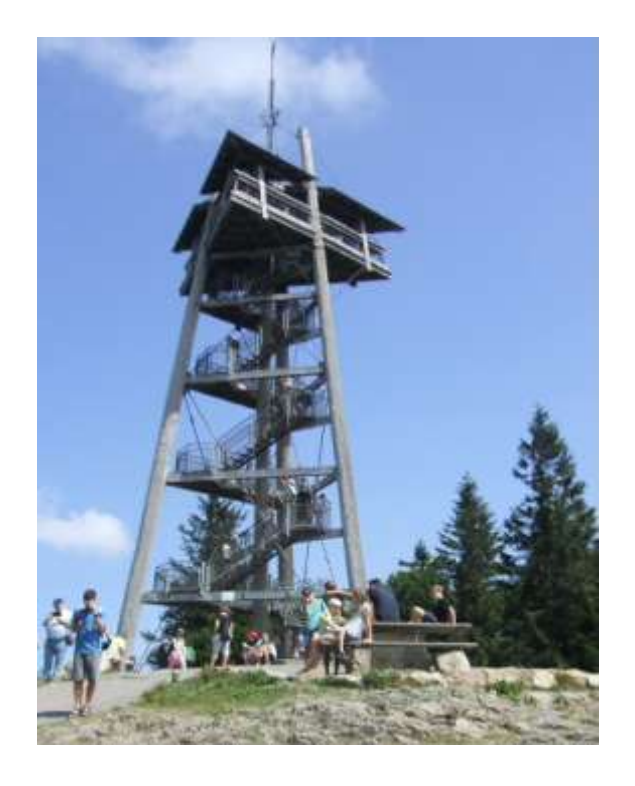
We returned to Freiburg for afternoon coffee, visiting the cathedral