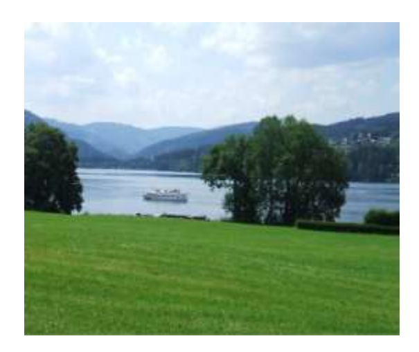
We returned to Hinterzarten by bus and this completed our holiday.