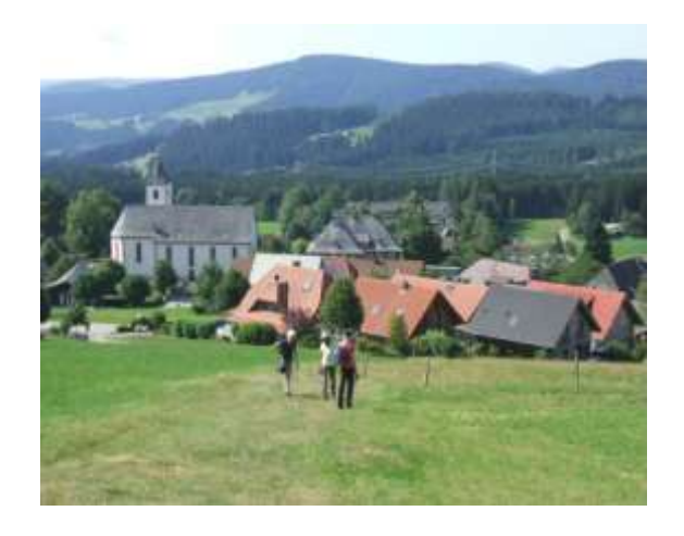
and into the woods.

We walked steeply uphill from the church