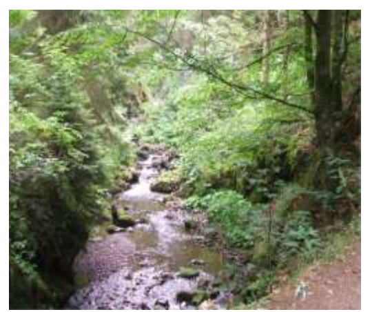
until we came out under the viaduct.