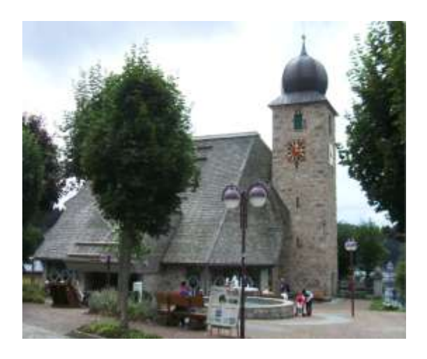
We had our lunch in a cafe with views over the lake. Then we went for a boat ride on the lake.