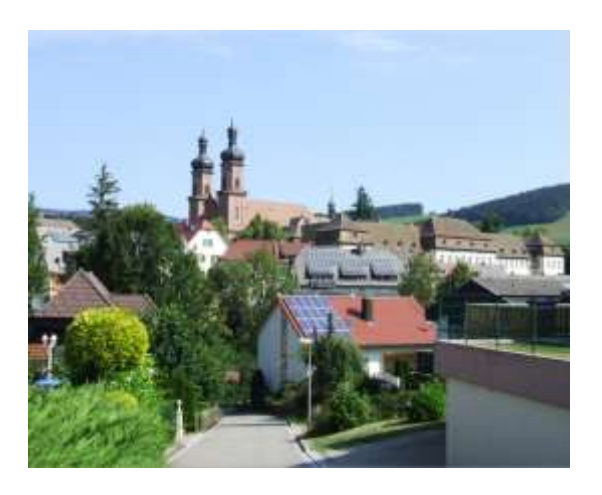
We came to a pilgrimage church