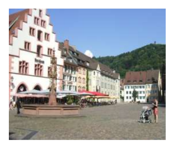
On the next day (Thursday), we took the bus to St Peter where there is a former monastery with an enormous church. As at Breitnau, it is decorated in rococo style.