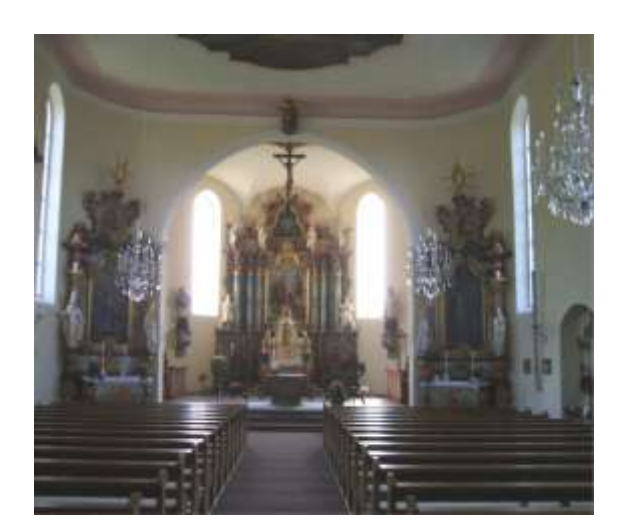
It is remarkably ornate for such a small village.

We walked steeply uphill from the church