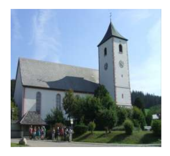
Inside, the decoration is in the rococo style.