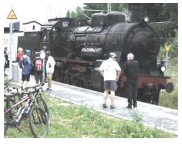
to Schluchsee which has an interesting