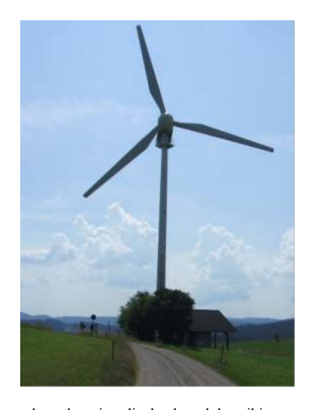
where there is a display board describing the operation of the turbine.

We walked on until we reached the picturesque Ravenna Gorge.