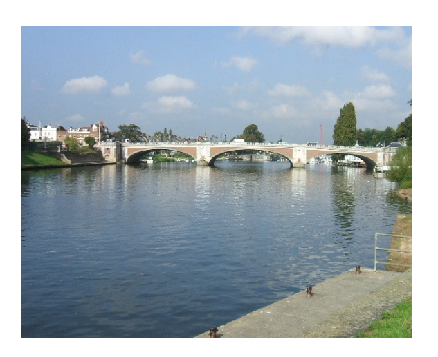
There is an island in the river.