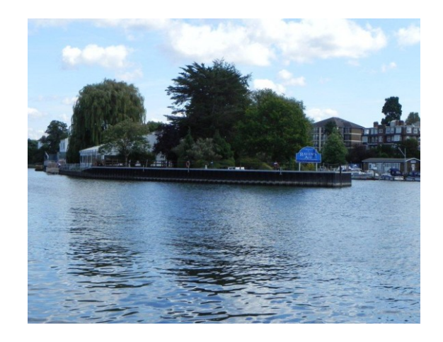
Some swans were on a landing stage.