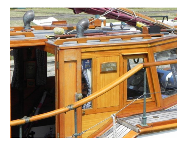
followed by Molesey Lock.