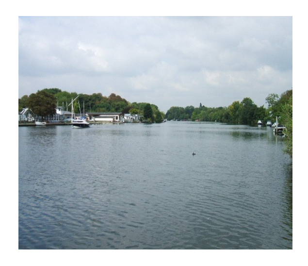
An imitation paddle steamer went past, with some house boats in the foreground.