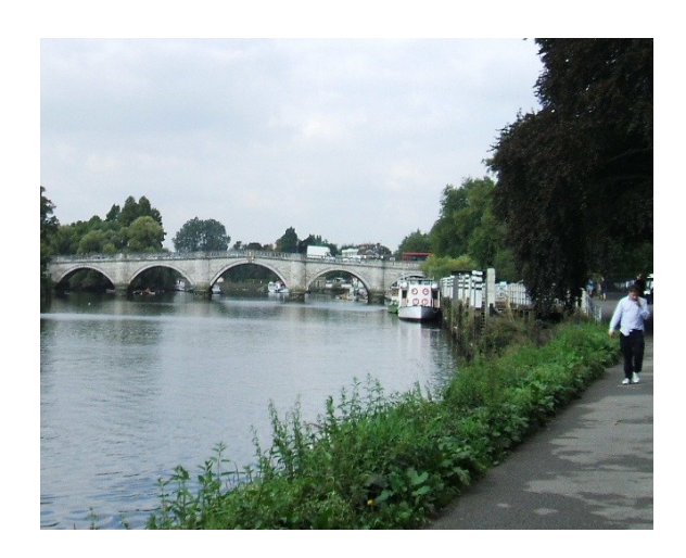
below the former Star and Garter home.