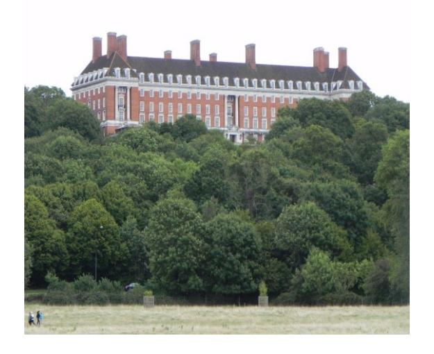
A small pleasure boat sailed past.