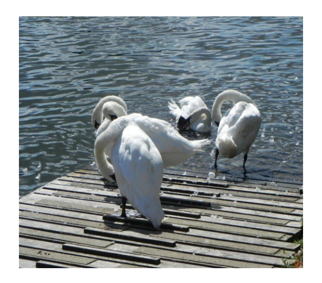
The next bridge was Kingston.