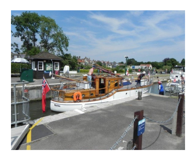
with a boat showing a plaque Dunkirk 1940,