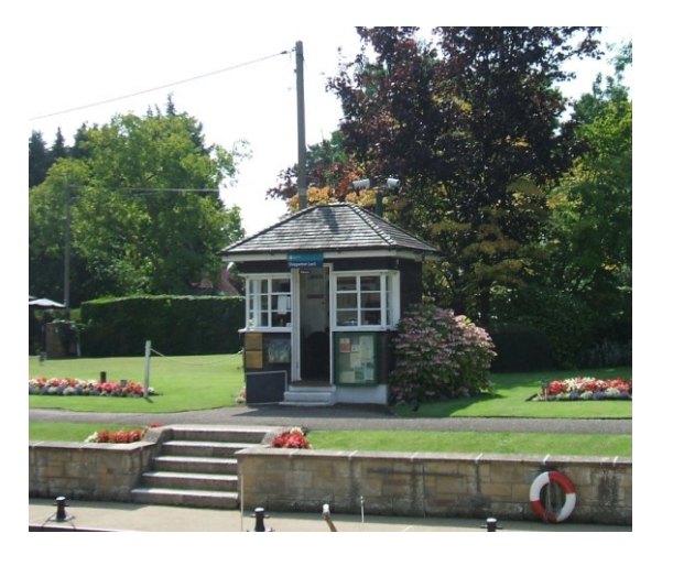
Just past Shepperton Lock, we took the ferry across the Thames.