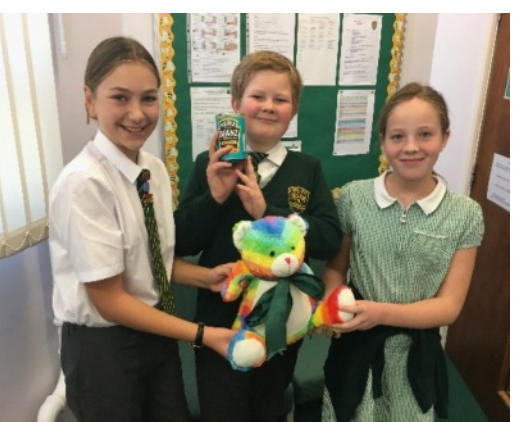
The LIFE ambassadors.

The LIFE Ambassadors work tirelessly to collect food for the Chelmsford Food Bank. They organised a Tin Tower Tournament, where the children brought tins of food into school and competed with each class to build the biggest tower. This term they have organised a, 'Break the Rules Day,' where the children can break rules in school (cautiously!) and bring in a