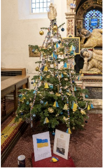
The winning Christmas Tree decorated by the WI

In December 2022, 14 local clubs, businesses, the school, preschool and church decorated trees on the theme of "A Country." During the Christmas Fair, visitors voted for their favourite tree and the runaway winner was the tree decorated by the WI in conjunction with some ladies from Ukraine who are staying in the village. The tree featured beautiful home-made paper decorations, some in blue and yellow. The Community Network was very pleased that they took part and hope they enjoyed this community event.