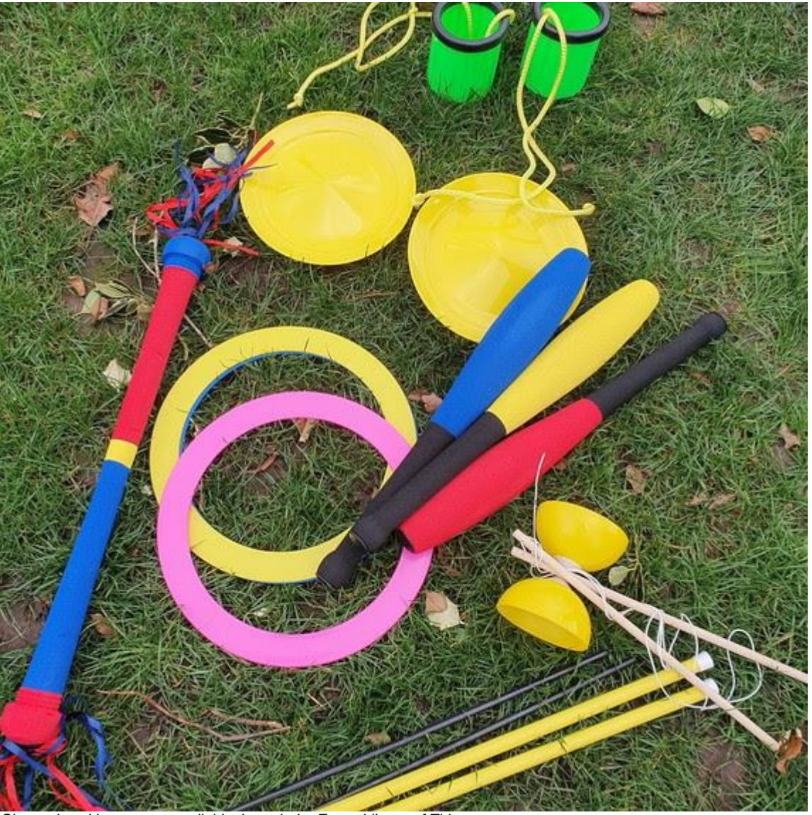
Circus show kits are now available through the Essex Library of Things

The Essex library of things is continuing to grow and has been very popular since it was first launched in September 2021 by Essex County Council.