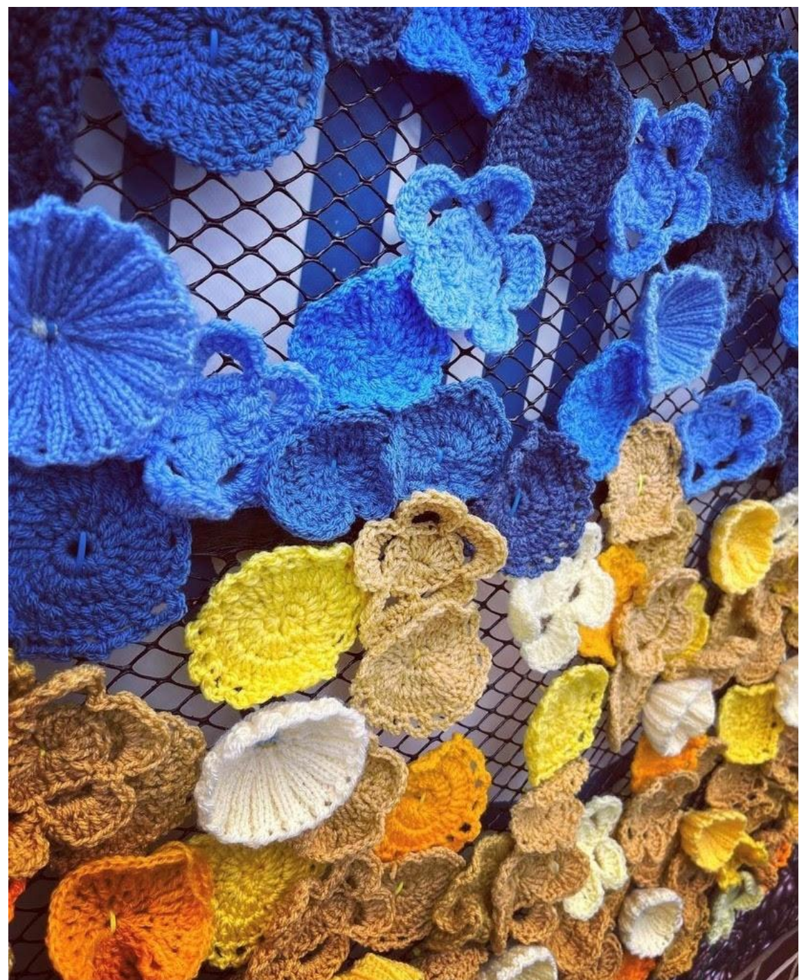
Cornerstone Church in Black Notley, who joined residents in crocheting and knitting this display of solidarity for Ukraine and its residents.

At a Full Council meeting on Monday, 28 March, all four political Group Leaders at our council expressed their support for the people of Ukraine and are ready to work with partner agencies to provide support to those affected by the war.