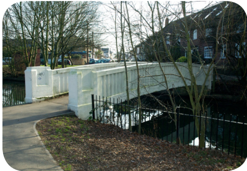
A pedestrian bridge