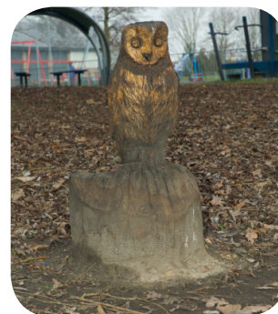
D carving of an owl