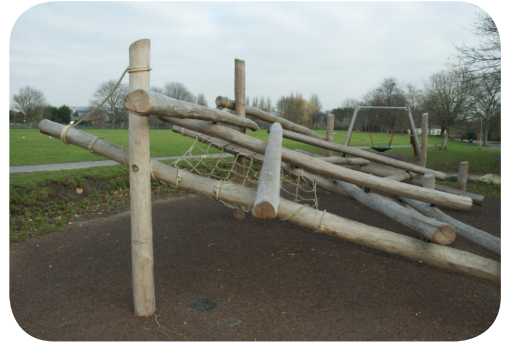
H climbing frame