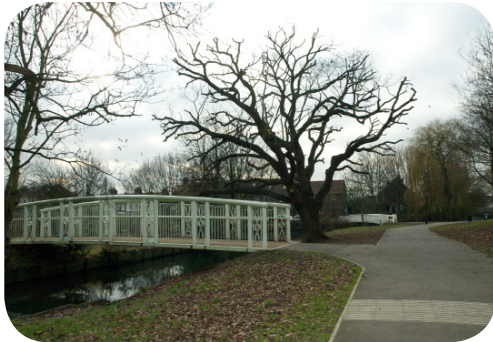
I kingfisher bridge