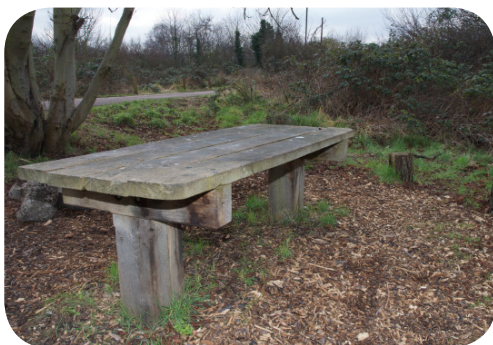
K outdoor classroom