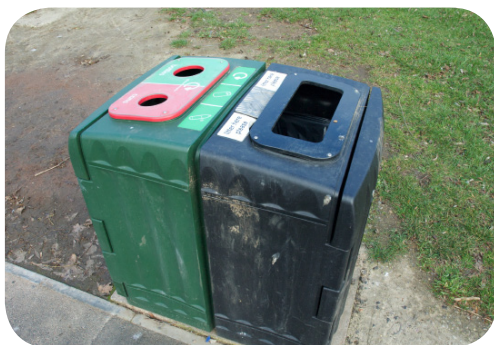
C recycling bin