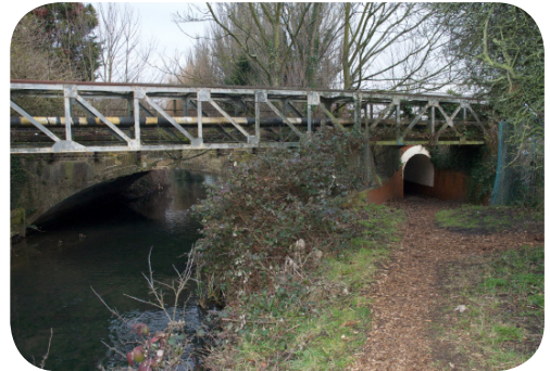
J railway bridge