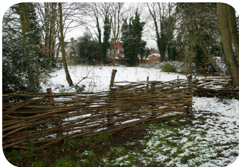
C hazel copse