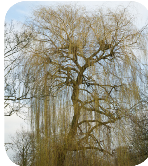
B willow tree