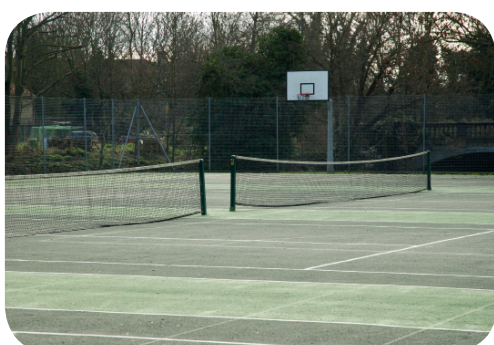
E tennis courts