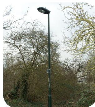
L lamp post