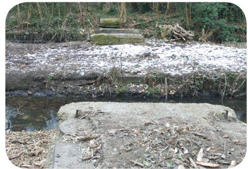
B mill ruins