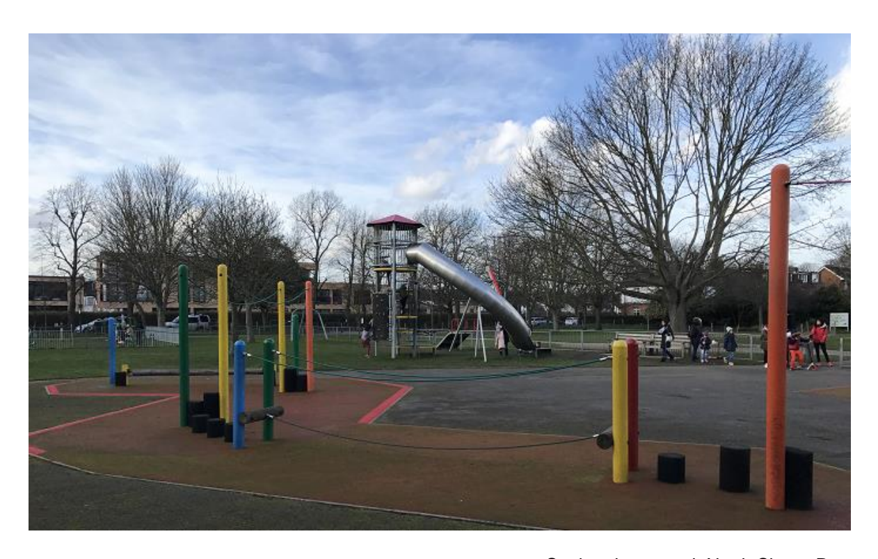
Senior playground, North Sheen Rec

The play areas were refreshed in 2016, with new equipment installed and older but still viable equipment renovated.