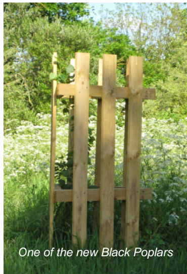
One of the new Black Poplars

Thames Landscape Strategy has asked us to keep an eye on the two new Black Poplars planted by the towpath near the Hawker Centre. Drying out is the main risk, so an occasional walk carrying a bucket might be in order.